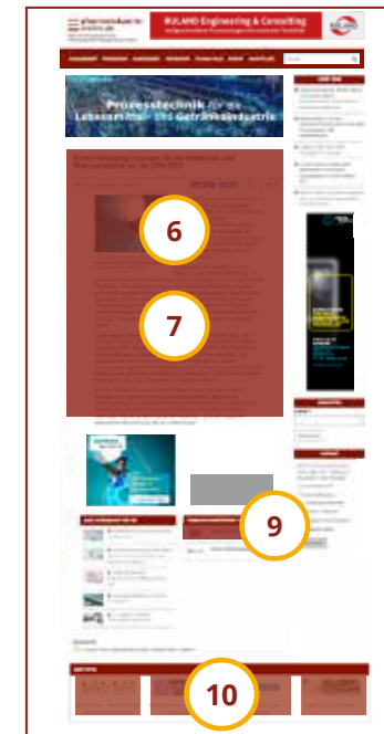
Article page desktop