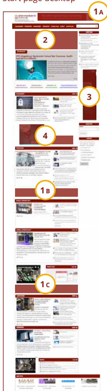
Start page desktop