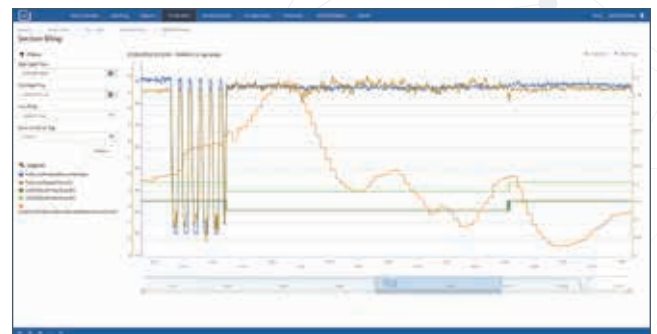
▲ Condition monitoring