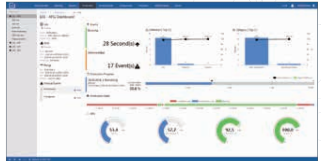
▲ Machine dashboard